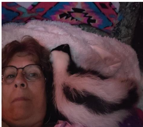
Piper and her Emotional Support Human

August, just four short months after losing her daddy, her mama passed away as well. Without her mama or her daddy there to take care of her any longer, and her grandparents not knowing how to properly care for her, the little girl, now an orphan, was signed over to Skunk Haven. Her mama, knowing how sick she was, made arrangements in advance for Skunk Haven to hold the spot for her, and for her to be adopted out to the people who used to babysit her, who loved her. The people who knew her and she was familiar with.