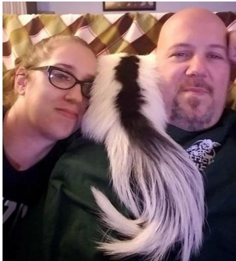
Piper with Mom and Dad

One little fur kid had such a beautiful life with her humans. She cuddled with mommy every day. She loved to curl up by her head and was so devoted to her mommy. But Mommy was sick quite often, so she was there to support her mommy through those tough times.